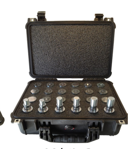
VOC 1 Pins Box (8) each 3/4", 7/8" & 1"

SMP Valve Out Tool also works flange-to-flange for flat faced flanges!