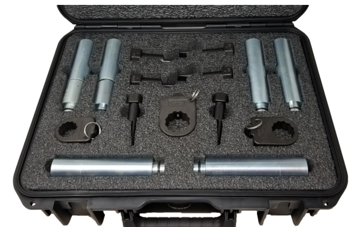
SMP Water Service Kit - Extra Spacer Bars Available for Wider Valves