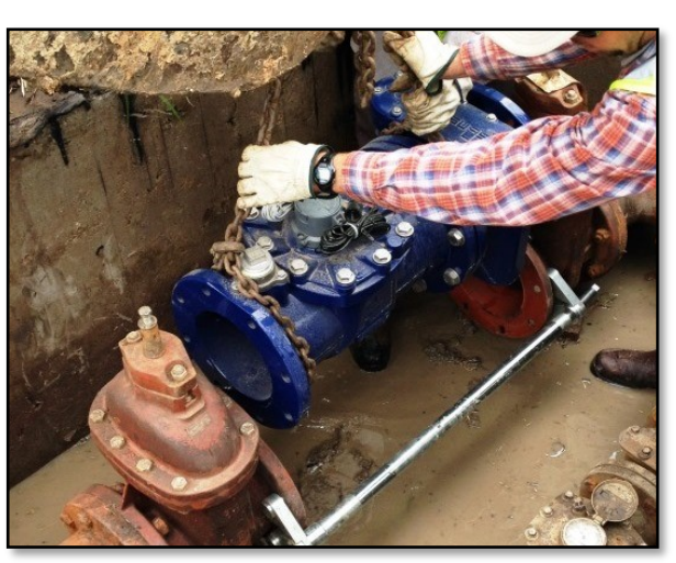
New Meter Installed