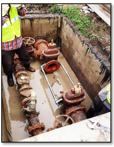
Spread & Hold Outside Flanges