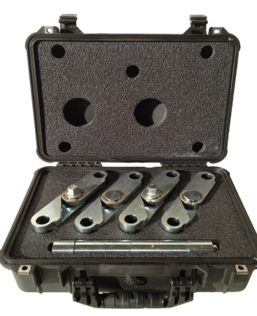
VOC Spreading Plates and Spacer Bars Box