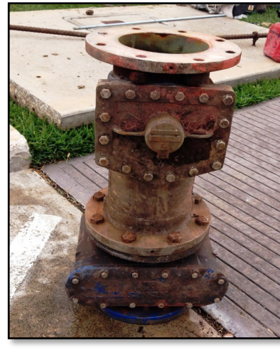
Old Meter Removed