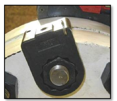
Piper Backup Wrench