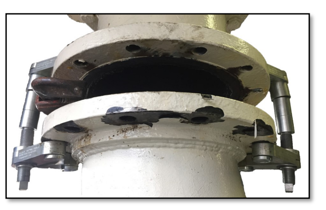
SMP Valve-Out Tool Works Great in the Vertical Position Too