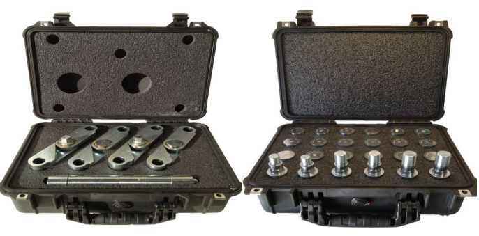
VOC Spreading Plates and Spacer Bars Box